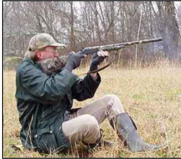
If I were NEF, I'd be embarrassed!

At right are the best of patterns from my F12 and Mossberg 500 at 35 yards. Quite a difference, and this just confirms my belief that this gun should come from the factory with the choke-tubed barrel. I've killed my last two birds with my custom Topper, so to use a different weapon this year I'll be toting the Mossberg.